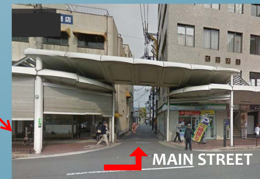
To alley from main street