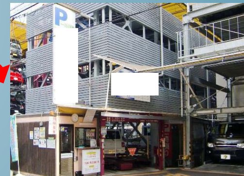
Parking in the alley UTILIZATION 33%